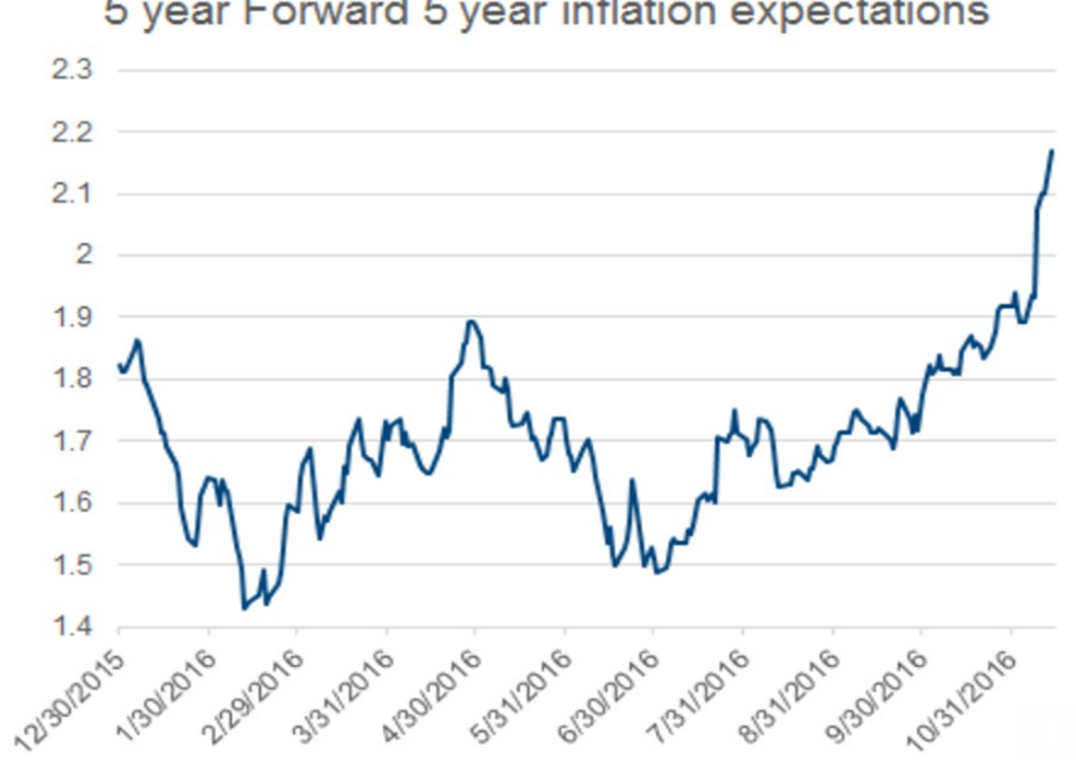
CHART OF THE DAY

We seen the big increase inflation expectations